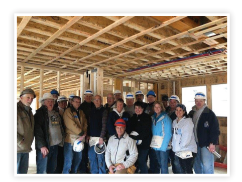
The SSHH board members roll up their sleeves to help in more ways than one!